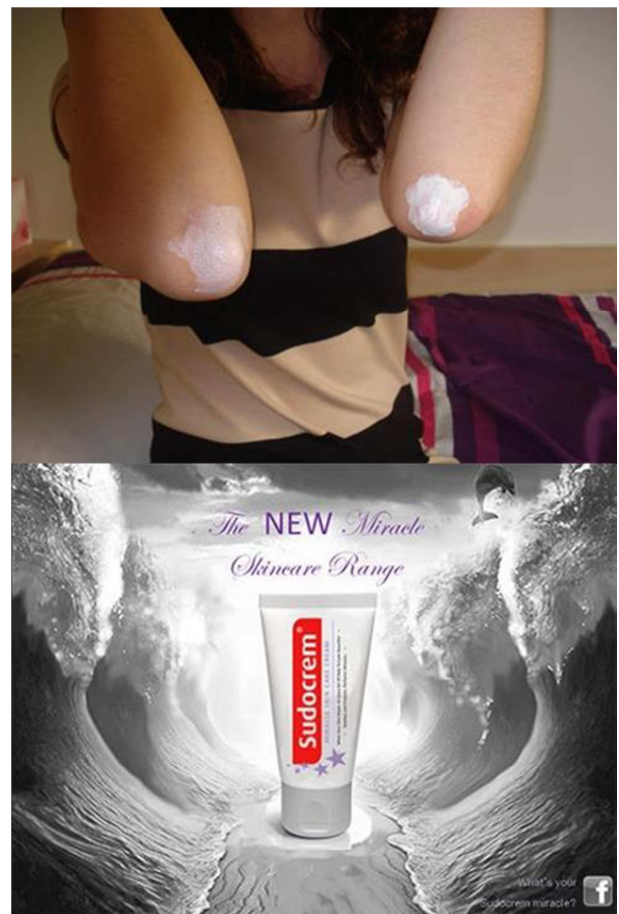
Figure 2. Images from the project presentation.

The project broadly followed the double diamond research process and blended design and marketing research methods. Methods used included intercepts, online-questionnaire, camera journals, shadowing, news article analysis, ethnography, user testing, and concept prototyping. The team were able to develop insights into user perceptions and triangulate their findings through a combination of design and marketing methods. For example, the use of an online survey provided an explicit opportunity for participants to convey their perceptions of the Sudocrem brand while these perceptions were also explored through shadowing and ethnographic activities. The blend of these methods provided a well-developed level of confidence in the findings.