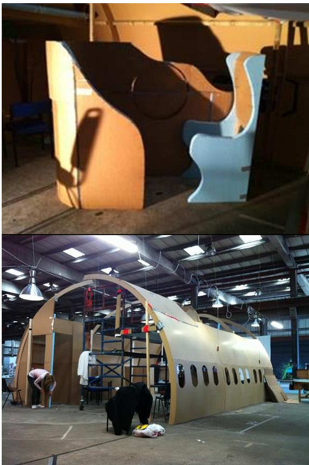
Figure 1. Images of the 1:1 scale build exercise testing spatial concepts.

The students explored different flight types (long or medium haul) and a range of passenger scenarios (single, couple or family travelers). Each group sought secondary data in-line with their specified scenario in addition to primary interviews conducted with flight attendants and a range of passengers. The research subjects were asked to recall flight experiences, record their preparations for travel and asked to consider human factors needs – physical, procedural and cognitive. From this data, mock-ups of travel scenarios were generated to visualize different flight experiences, along with development of passenger personas. An info-graphic based poster was produced by each scenario group highlighting key research findings along with a narrated movie of passenger experiences providing qualitative personal insights of travel experiences.