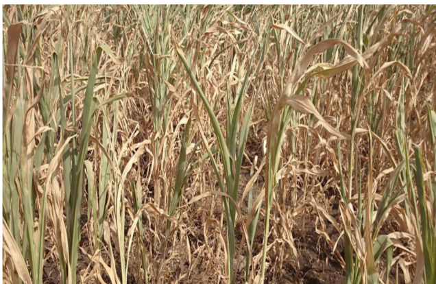
Figure 2. Impacts of drought stress on sorghum in Ethiopia, Photos—January 2016..

Sorghum, as a significant crop for climate change resilience, is outstanding for smallholder farmers in Africa and Asia who have no access to irrigation to sustain food security [38]. Climate change has resulted in the instability of weather patterns, particularly in arid areas where the duration of dry periods has increased, resulting in crop wilting and food shortages. Figure 2 shows the impact of drought stress on sorghum plants in Ethiopia.