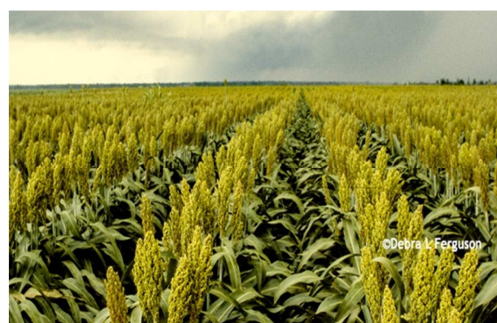
Figure 4. Early-flowering sorghum varieties

Drought stress during flowering decreases silk elongation, lengthens the anthesis silking delay, and reduces ovule fertilization and kernel abortion. Early flowering and short reproductive periods are essential characteristics under extreme drought circumstances because they reduce exposure to dehydration during the critical flowering and post-anthesis grain-filling periods [55]. In environmental settings with insecure rainfall or terminal dryness, flowering before the start of a development restricting drought is a key approach to guaranteeing yield production.