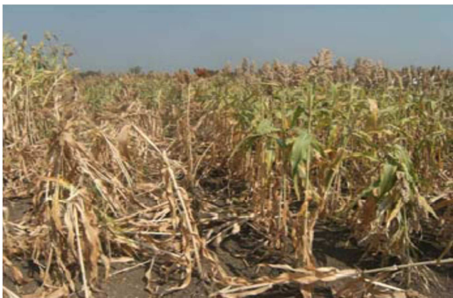
Figure 5. Photograph showing the stay-green trait in sorghum the field in Petancheru, India. The photograph was taken at the post-flowing stage with no supplemental irrigation. Sorghum plants on the right have the stay-green trait (B35), whereas plants on the left are senescent varieties (R16) (Kumar et al., 2011).

Drought stress causes varying responses in water consumption efficiency in leaves. Water usage efficiency at the level of the leaf is intimately tied to the physiological mechanisms controlling CO 2 and H 2 O gradients between the leaf and the air around the leaf [56]. Optimal leaf area is critical for optimum photosynthetic performance in a drought scenario. Furthermore, in drought-prone areas, optimum leaf area is critical to achieving high dry matter content and grain yields [57]. Sorghum's drought resistance was greatly influenced by leaf area. In regions prone to drought, the leaf area of sorghum is reduced to reduce water loss through evapotranspiration. Plant consumption of water and biomass buildup must take into account soil water evaporation rate, transpiration from the leaves, and plant growth style. Implementing techniques that minimize soil water evaporation and shift more water towards transpiration can improve water usage efficiency at the canopy level [56].